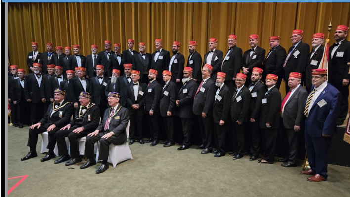
Valley of Pensacola — 2025 Honors