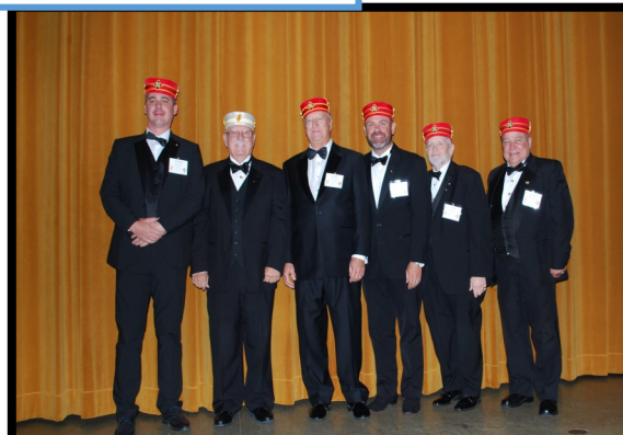
Hon. Riley, Ill. Parks, Hon. Covington, Hon. Schutts, Hon. Eckols, Hon. Vest Jr.